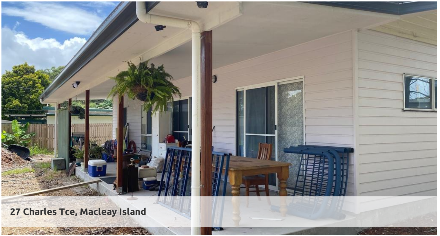
27 Charles Tce, Macleay Island