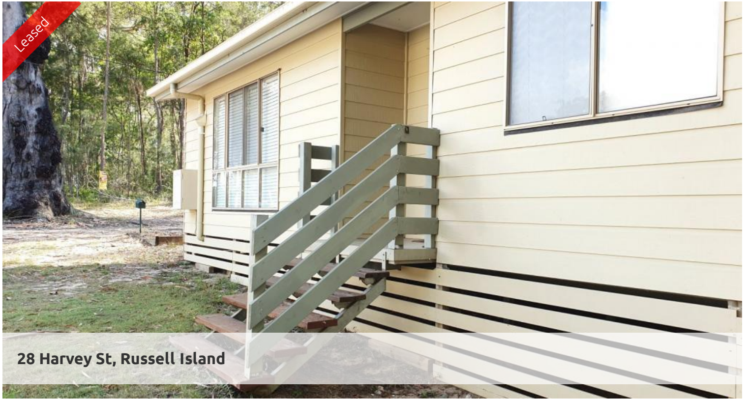
28 Harvey St, Russell Island