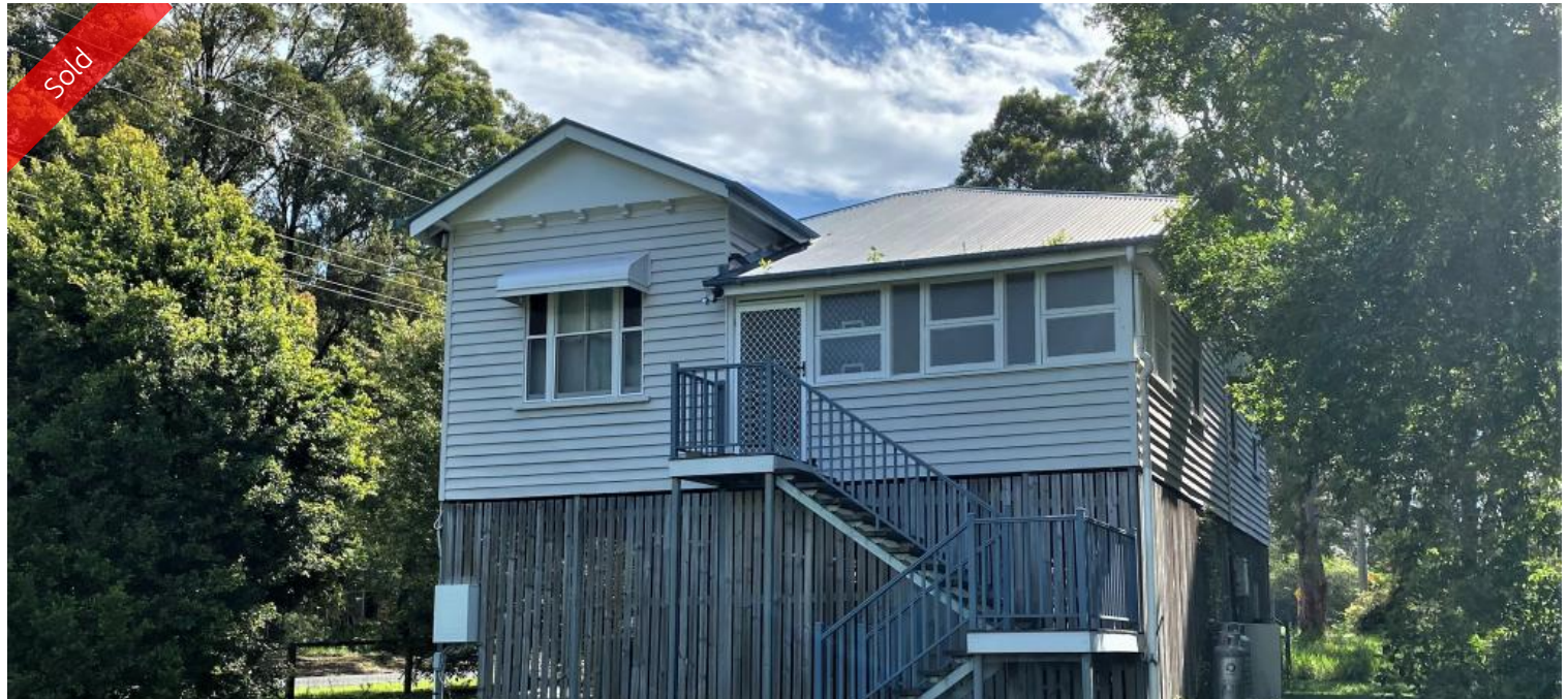
1 Lemontree Dr, Macleay Island