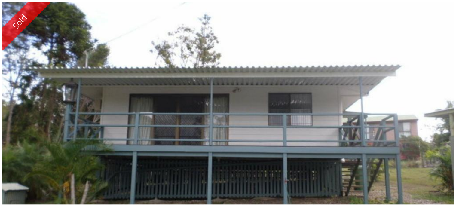
3 Ashton Street, Macleay Island